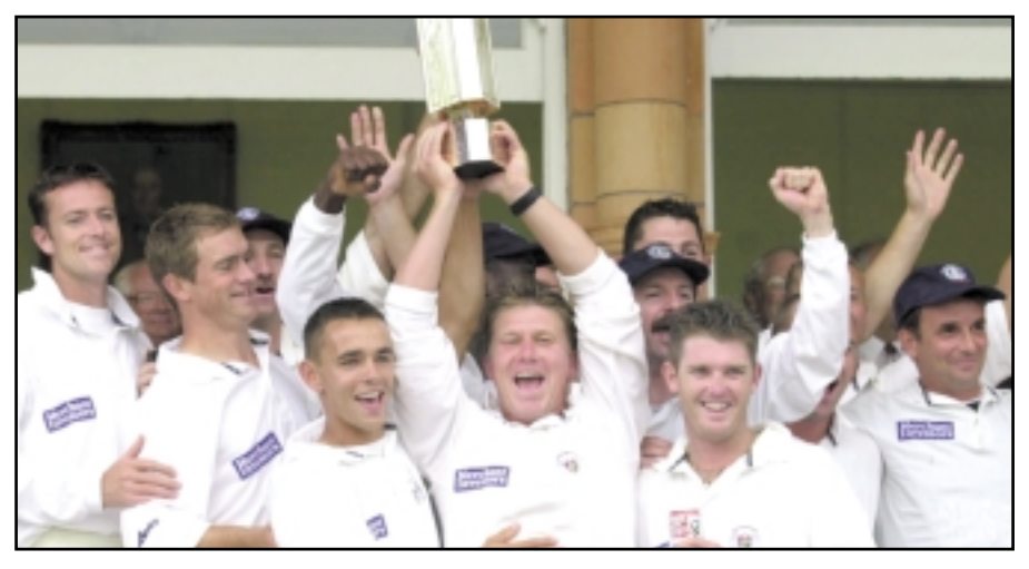
Gloucestershire's players celebrate retaining the NatWest Trophy

NatWest's focus now switches to the NatWest Series. England won the inaugural tournament this summer against Zimbabwe and the West Indies, and they will defend it next year against Australia and Pakistan.