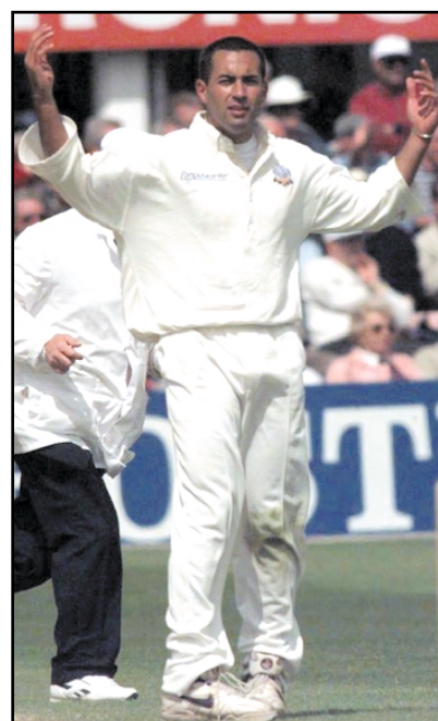
Surrey captain Adam Hollioake will be hoping to lead his side into the NatWest trophy semi-finals as they meet Lancashire for a place in the last four – preview page 6

Glamorgan spinner Robert Croft will be hoping the pitch offers some turn, while the home side's Ashley Giles has the ability to take advantage of any assistance offered by the wicket. The remaining tie of the round takes place at Lord's, the ground which will host the final at the end of August, where Middlesex take on Hampshire.